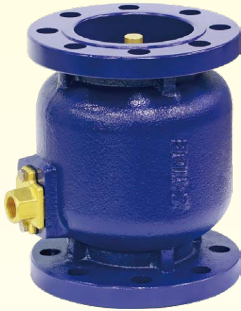
▲ Cast Iron Materials